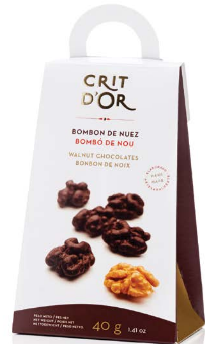
WALNUT CHOCOLATES 40 g.

Handmade caramelised walnuts, coated in dark chocolate (minimum 70% cocoa).