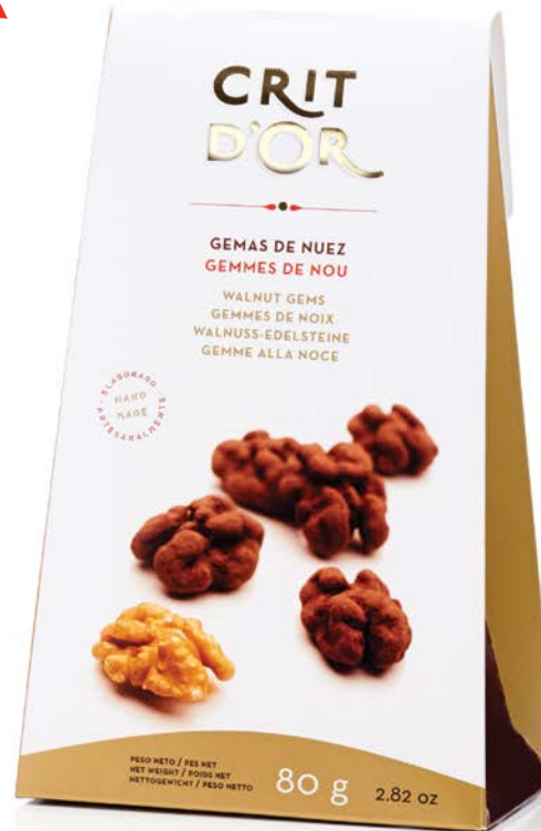
WALNUT GEMS 80 g.