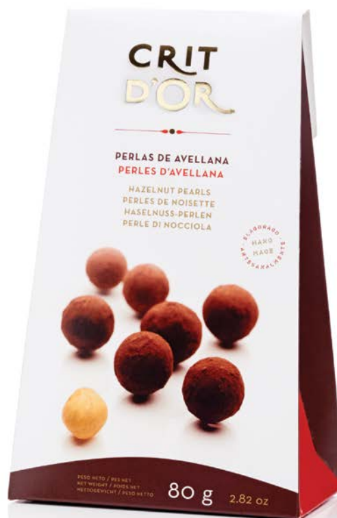
HAZELNUT PEARLS 80 g.

Handmade caramelised hazelnuts, coated in white chocolate praliné, and dusted in cocoa powder.