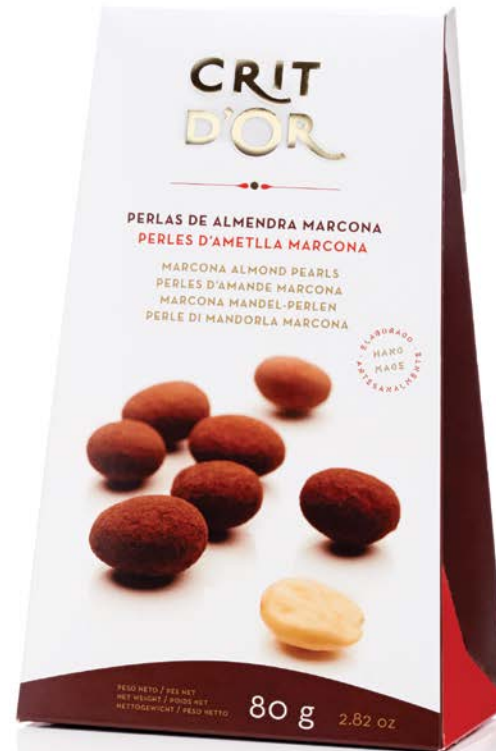
MARCONA ALMOND PEARLS 80 g.

Caramelised whole Marcona almonds (s/16 size), coated in white chocolate praliné, and dusted in cocoa powder. One of the most typical products of Barcelona, which you can find in almost every pastry shop. Discover our original recipe.