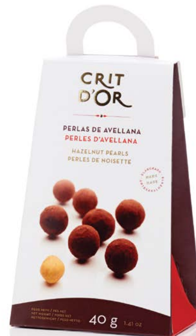
HAZELNUT PEARLS 40 g.