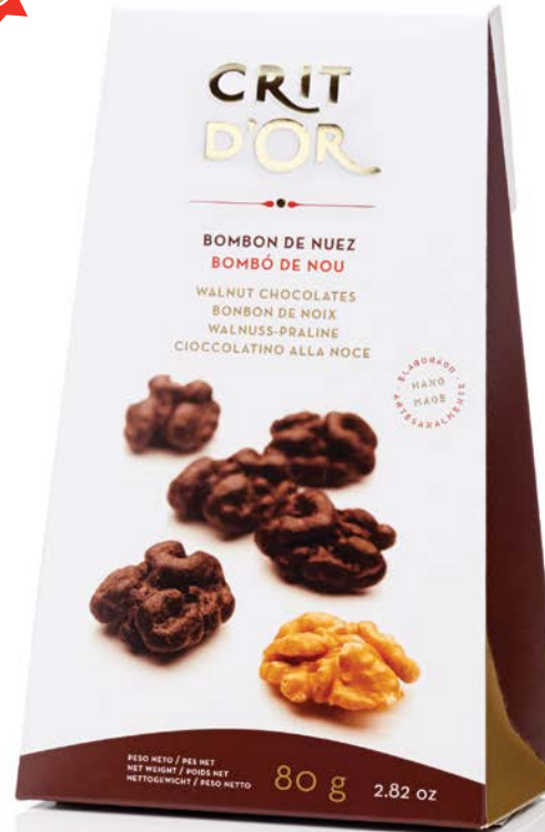
WALNUT CHOCOLATES 80 g.