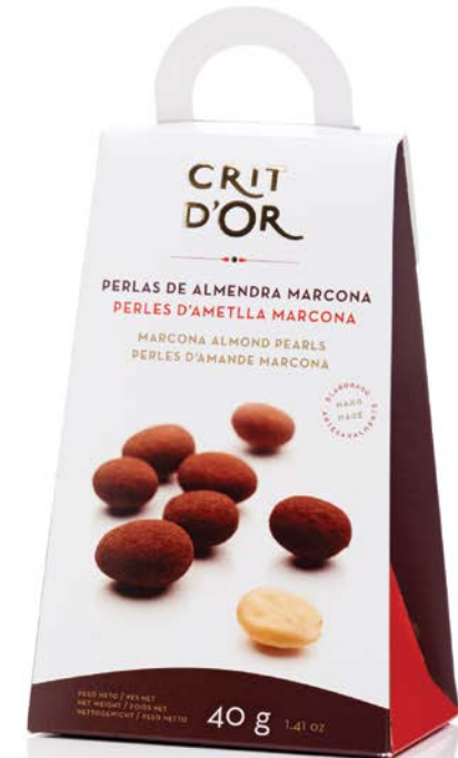
MARCONA ALMOND PEARLS 40 g.