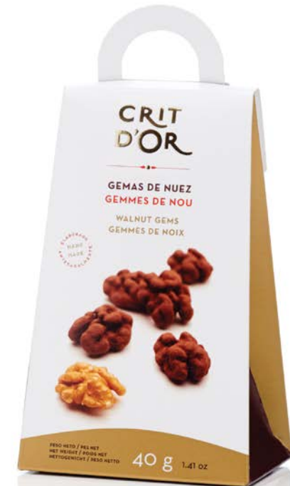
WALNUT GEMS 40 g.

Handmade caramelised walnuts, coated in dark chocolate (minimum 70% cocoa) and cocoa powder.